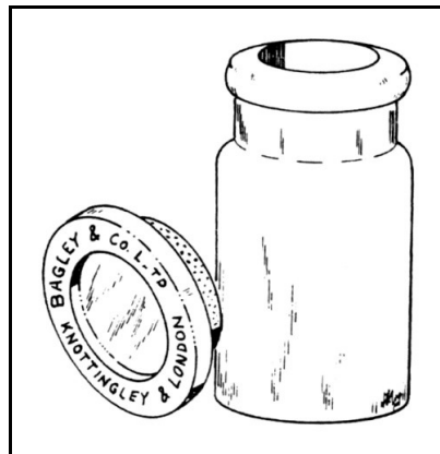
Figure 4 – BAGLEY & Co LTD mark on jar lid (Creswick 1987:10)

At least one cod-stoppered bottle on eBay was marked on the back heel with Bagley & Co. Ld. 3 Creswick (1987:10) also illustrated and discussed a jar with a lid embossed “BAGLEY & Co LTD (arch) / “KNOTTINGLEY & LONDON (inverted arch).” The jar was light green in color, and she dated it ca. 1895. This was almost certainly a product jar (Figure 4).