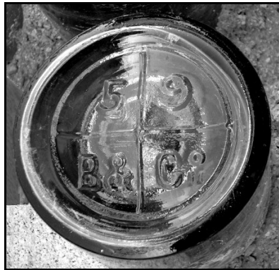
Figure 3 – B&C o basemark

Toulouse (1971:77, 79) showed the logo as “B&Co” and considered it to have been used by two companies. Bagley & Co., Knottingley, Yorkshire, England, marked its bottles thus “by 1880 according to bottle-making techniques used, and possibly at start of company, 1871.” Edgar Breffit & Co. also used the mark (along with three others) sometime between ca. 1842 and 1913. Toulouse (1971:79) noted, however, “Due to the long life of this company, no dates have been possible for specific variations of the several marks used. The bottle’s age must be judged by the technique in which the bottle was made.”