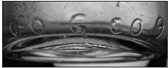
Figure 1 – C-OGCO 9 logo (California Parks collection)

When the Bottle Research Group examined the 120-box California State Park milk bottle collection at Sacramento in 2006, we discovered four interesting heelmarks on machine-made, embossed milk bottles: