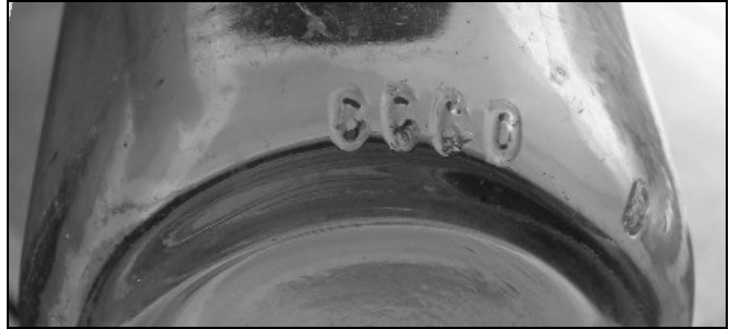
Figure 3 – CGCO 6 logo

have been made by the same company. All of these bottles were used by southern California dairies. Giarde (1980:28-29) believed the CGCo mark on milk bottles may have belonged to the Coshocton Glass Co. between 1907 and 1915, although he called Coshocton's connection to milk bottles "tenuous." We, too, have found no evidence that Coshocton made milk bottles. See the file for the Cohansey Glass Co. for a discussion of the "CGCo" logos.